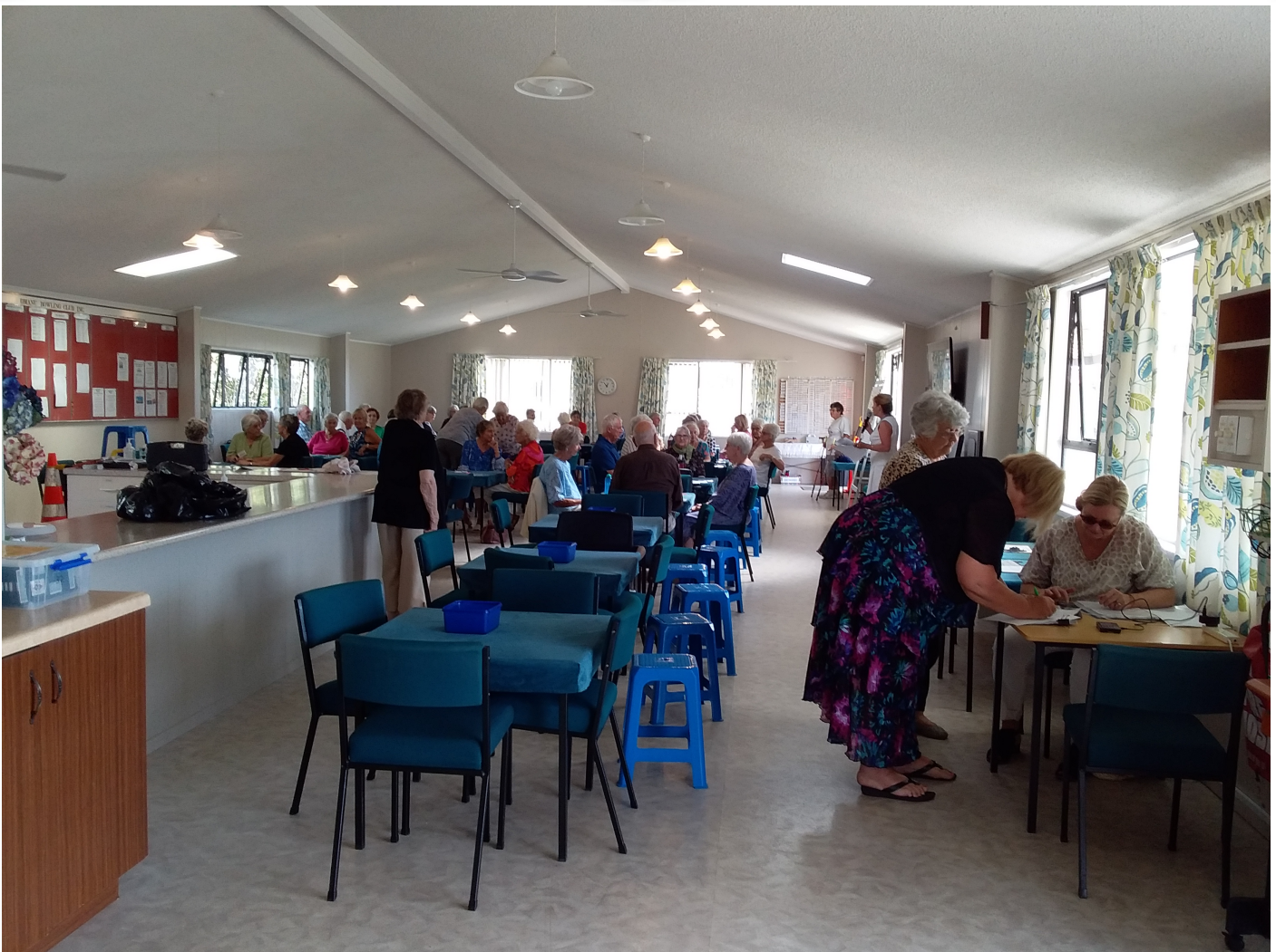
Above: 1st day of play in our new temporary premises 22 Feb 2021